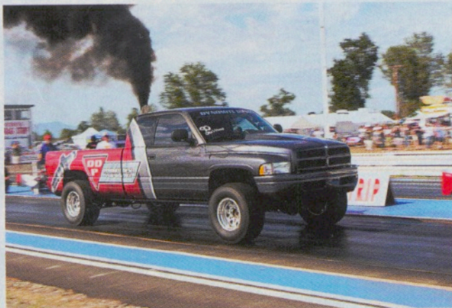
First place in the Outlaw drag class, first in Powder Puff Modified and second in Modified — it was a good day for Lenny and Margo Reed.