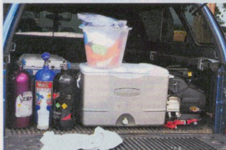
Coming prepared with two coolers and 30 pounds of nitrous makes for an interesting day at the track.