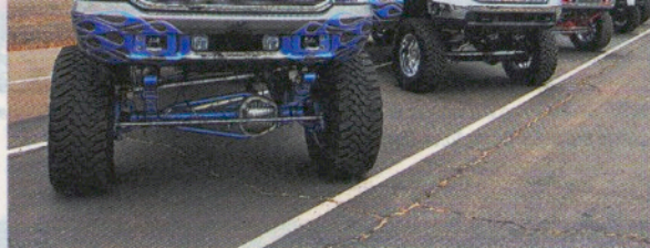
Gray skies cleared up providing triple-digit heat, but not before they showered the freshly detailed Show-n-Shine contestants.