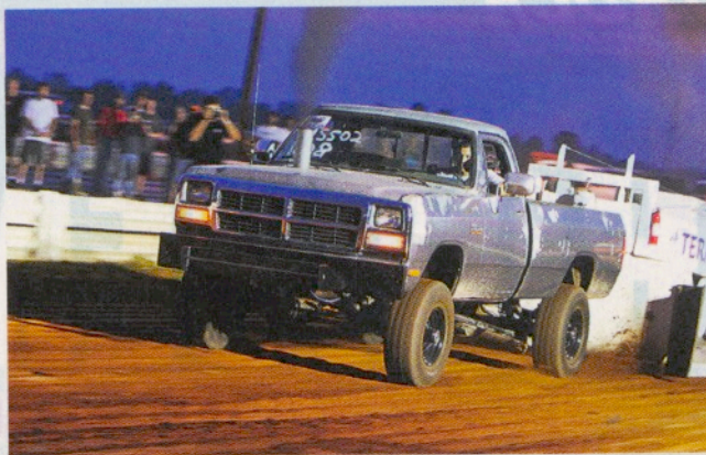
The First Gens were out in full force, including Cole Dowe's 479.6-whp '93 Dodge that also took second place in the Super Street pulling class.