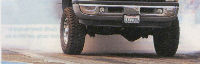
There wasn't a burnout competition but you wouldn't know it by looking at this Dodge's pre-race tire warming.