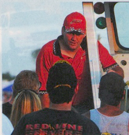
The guys at MLM Motorsports provided the sled and gave everyone the ins and outs of proper pulling etiquette prior to the competition.