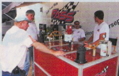
FASS Fuel Systems was one of several manufacturers available to answer questions about their product lines. FASS also brought along a fancy display to show the benefits of its systems.