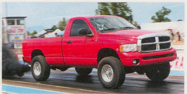
Tired of always being a spectator while her boyfriend raced, Cecilly Grant decided to enter her first-ever event. The rookie finished second in bracket racing and fifth in the Powder Puff Super Street class.